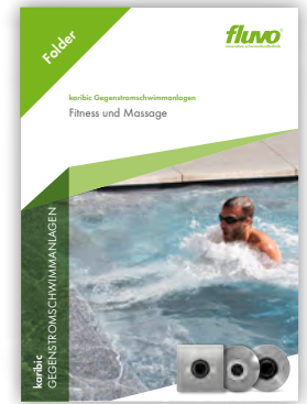
karibic Gegenstromanlagen karibic Counter current system