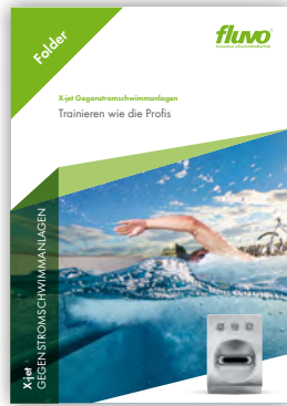
X-jet Gegenstromanlagen X-jet Counter current system