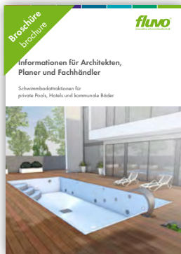
Inform. für Planer & Architekten Inform. for architects, dealers & builders