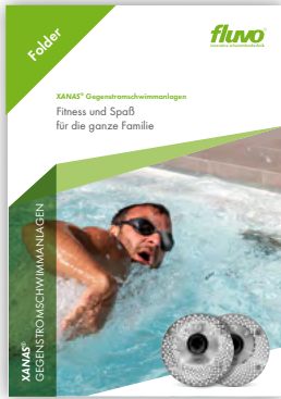
XANAS® Gegenstromanlagen XANAS® Counter current system