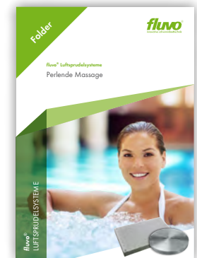
Luftsprudelsysteme Air bubble systems