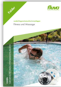
rondo Gegenstromanlagen rondo Counter current system