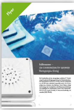
Instreamer Einströmdüse Instreamer inlet nozzle