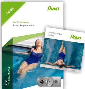
Hydro-Massage inkl. Massage Guide Hydro-massage incl. massage guide